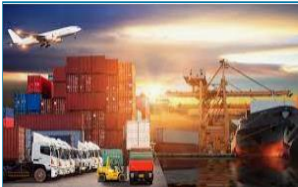
D365 Business Central for Transport and Logistics