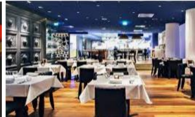
D365 Finance & Supply Chain Retail with Hospitality