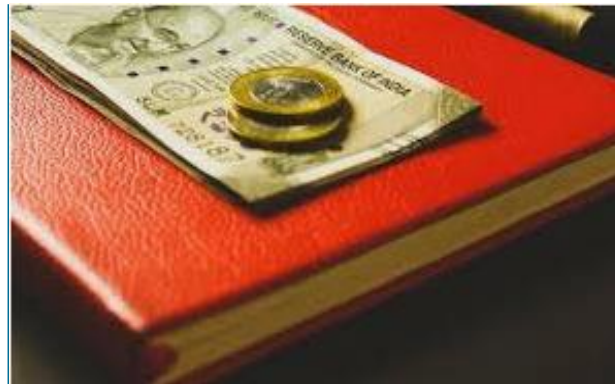
D365 Finance & Supply Chain for Non-Banking Financial Companies (NBFC)