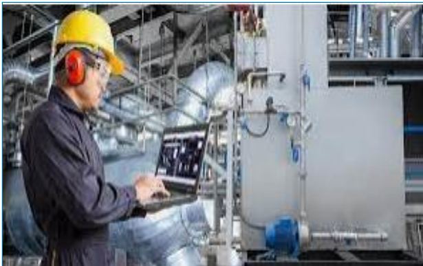
D365 Finance & Supply Chain for Manufacturing