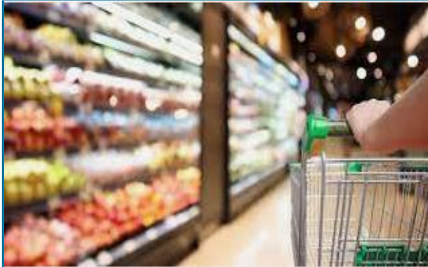
D365 for Commerce