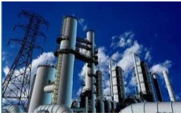
D365 Finance & Supply Chain for Oil Distribution